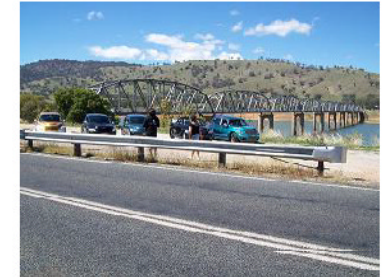
PT's display Sunday show n shine