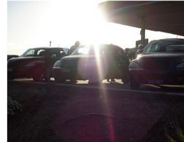
Ettamougah Pub Cruise saturday